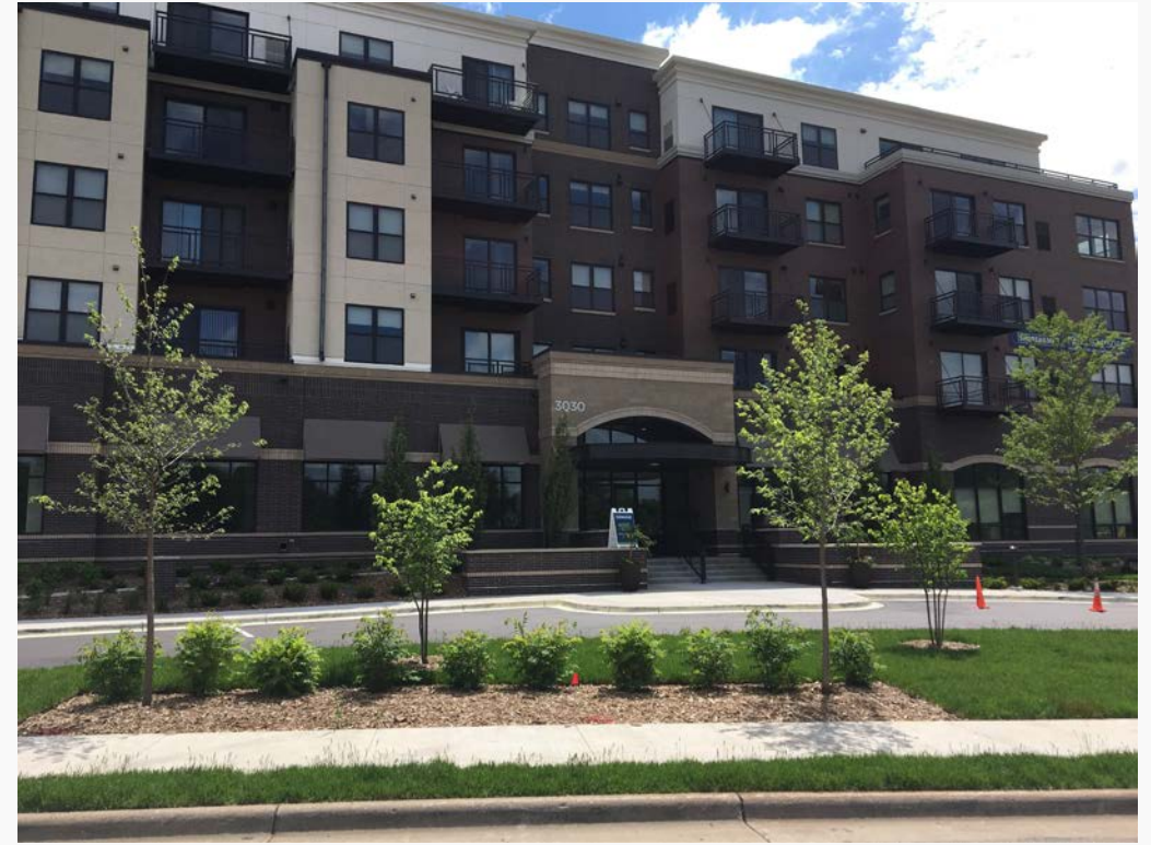
THE SHOREHAM-ST. LOUIS PARK