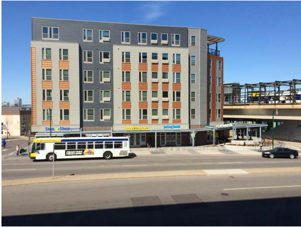
LAKE STREET APARTMENTS-MINNEAPOLIS